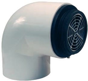
adapters and caps sold separately