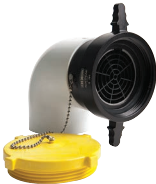
adapters and plugs sold separately